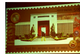
Platinum Jubilee of Reserve Bank of India, 2010. Commemorative Postal Stamp.

CEBR (Center for Economic and Business Research ) UK website cebr.com says that: