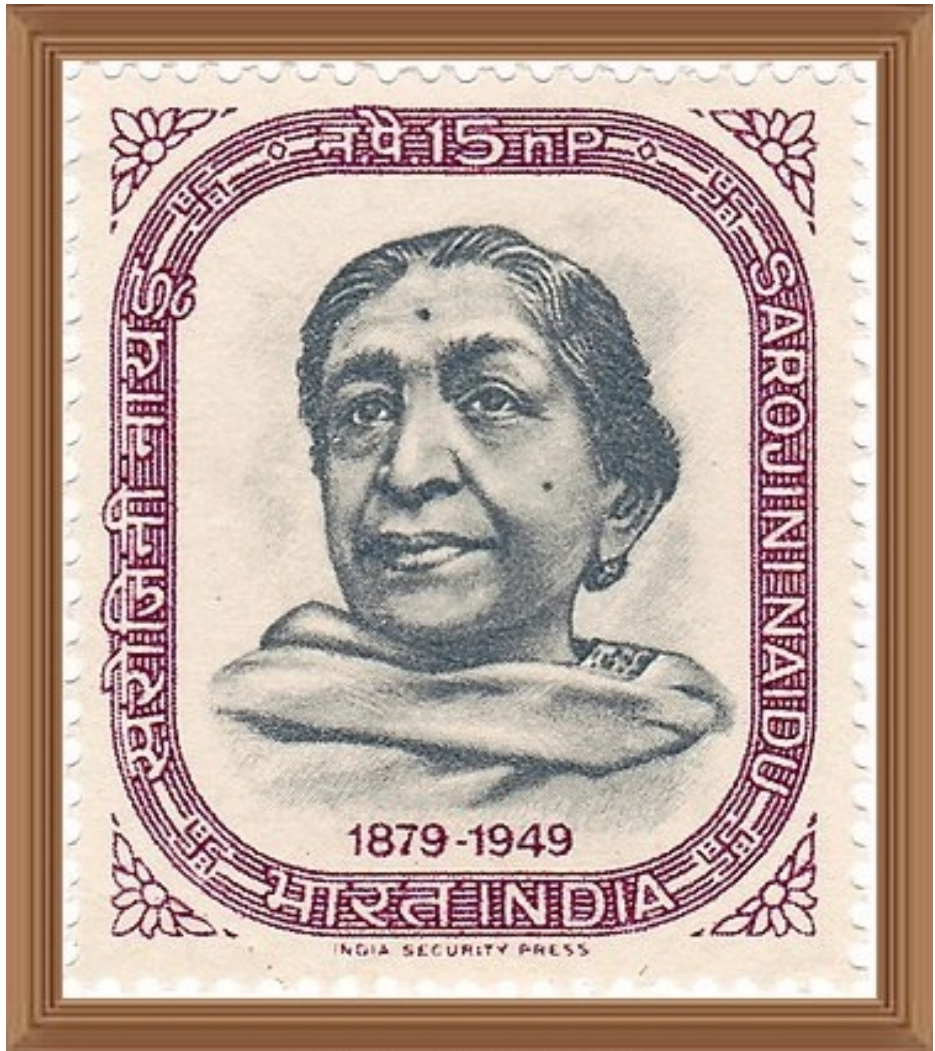
FREEDOM-FIGHTERS OF INDIA