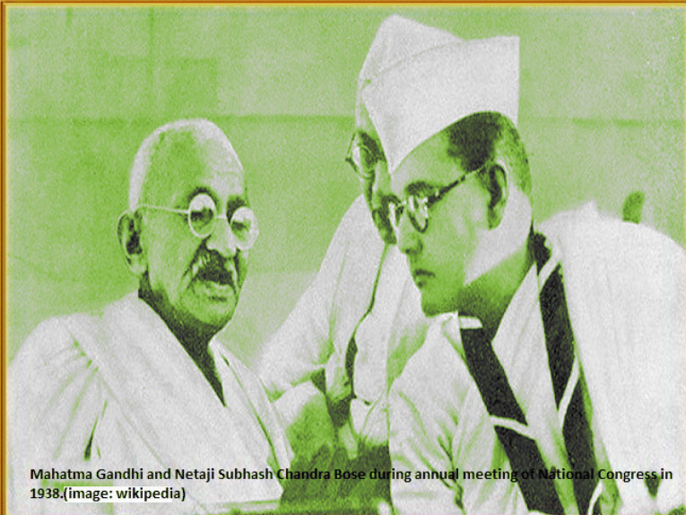
Mahatma Gandhi and Netaji Subhash Chandra Bose during annual meeting of National Congress in 1938.